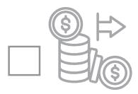
Capital Expenditure Forecasting