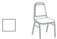
Banquet Chair Cleaning