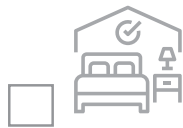
Guest Room Carpet Cleaning