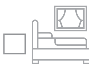
Guestroom Asset Assessment